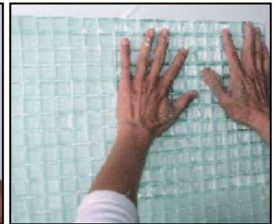
STEP 6 Apply additional sheets taking care in aligning grout joints and maintaining a constant pattern.