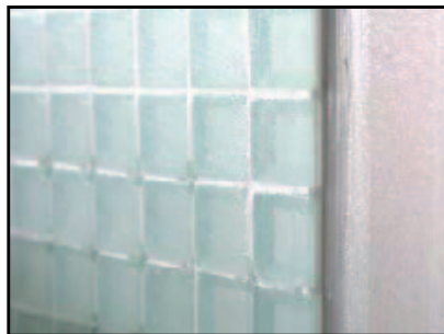
STEP 8 Once sheets are fully placed on the setting bed, adjust where visually required.