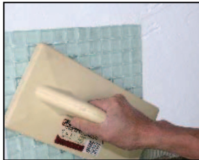
STEP 5 To achieve an even surface, press lightly using a flat trowel, or a flat board.