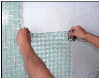
STEP 4 Butter the sheet rear in full with a flat trowel. Apply sheets onto the setting bed (clear film side towards you).