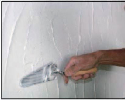
STEP 1 Firmly apply the adhesive onto a perfectly flat substrate, if necessary the surface should be rendered first.