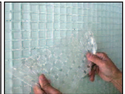
STEP 9 Allow for a minimum of 24 hrs setting period prior peeling off the plastic mesh from the mosaics sheets.

Same installation procedure must be used for the following products