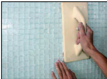
STEP 7 To maintain an even surface, flatten sheets at joints using a flat trowel or flat board.