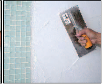
STEP 3 Flatten notches to achieve a smooth and even surface of approximately 8 mm thickness.