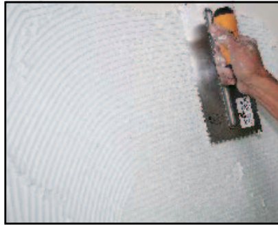
STEP 2 Using a small V-Notch trowel fully apply additional adhesive.