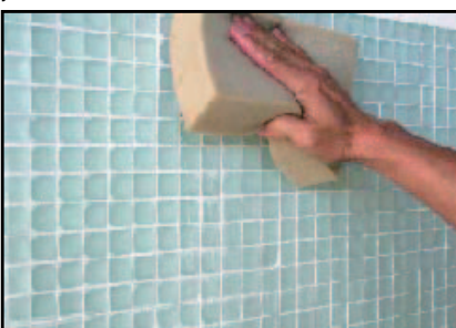
STEP 11 Allow for the grout to set (turn dull) and clean up with a damp sponge.